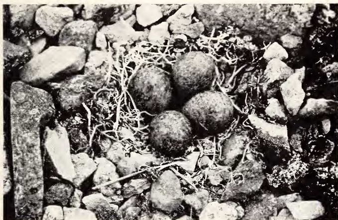
Fig. 3. Nest of Ruddy Turnstone, 19 June 1960.

When their territory or nest site was approached, the Ruddy Turnstones often flew at the intruder, uttering their distress calls. In the absence of its mate the incubating bird usually performed the typical injury-feigning distraction display.